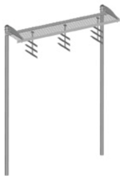
Safety Grated Waveguide Bridge Kit, 12 in x 10 ft, with two 13 ft 4 in direct burial posts